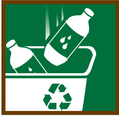
REDUCE, REUSE, RECYCLE